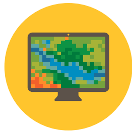
Better Spectral Data