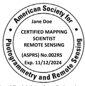
☐ Certified Mapping Scientist – Remote Sensing OR GIS/LIS