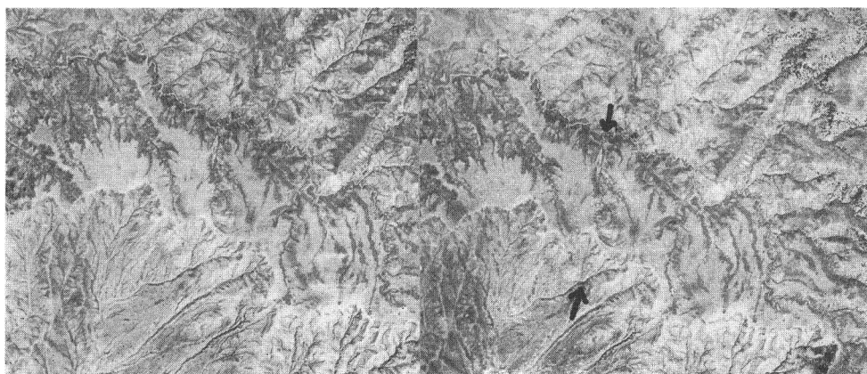
FIG. 2. Stereo pair showing fracture trace seen in cross section in Figure 1. The fracture trace is expressed by drainage alignments in the western Powder River Basin, Wyoming. The fracture trace is indicated by the two arrows.

between dominant fracture-trace and joint sets in flat to gently folded Carboniferous rocks of the Allegheny Plateau in central Pennsylvania. This relationship was confirmed in a later study by Hough (1959). Subsequently Keim (1961), working in the folded and faulted terrane around Bisbee, Arizona, found that the dominant fracture-