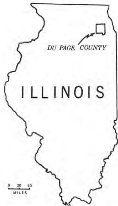
Fig. 1. Index map of Illinois, with Dupage County indicated by arrow.

page County) was selected for photogeological analysis because of active geological and groundwater study interest, and because of the availability of quantitative field data. Despite efforts to locate areas in which photogrammetrically identified lineaments might be traced into quarries or outcrops and identified as joints, results were inconclusive.