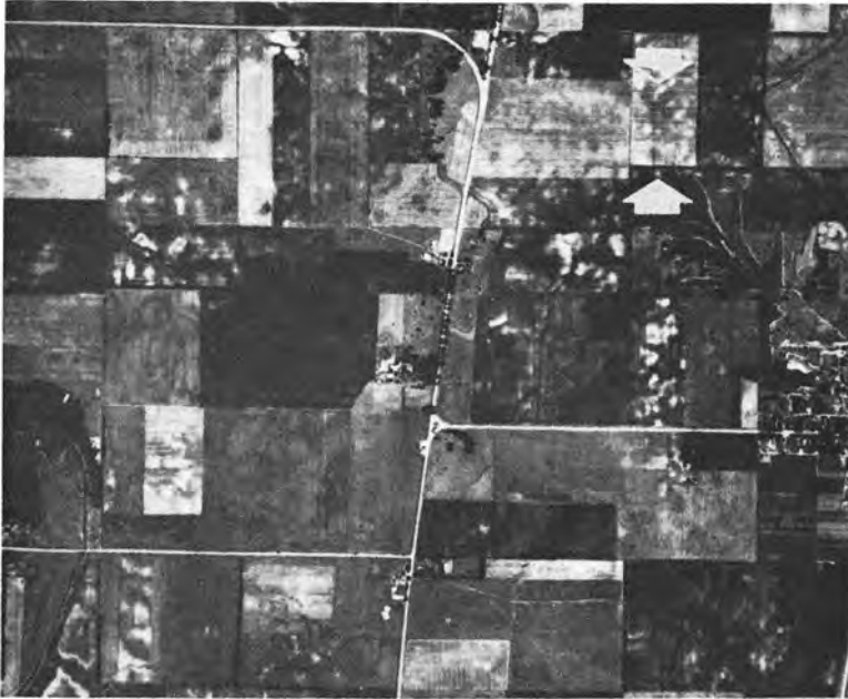
FIG. 3. Area of Tinley ground moraine, northeastern Dupage County. Mottled appearance is generally characteristic of tills in the midwestern United States. Arrows indicate one (and possibly two) fracture traces trending N 5°E.

is more obvious than isolated features of similar origin. Light-colored crevasse fillings in Illinois contain a mixture of relatively permeable sand and gravel which image in