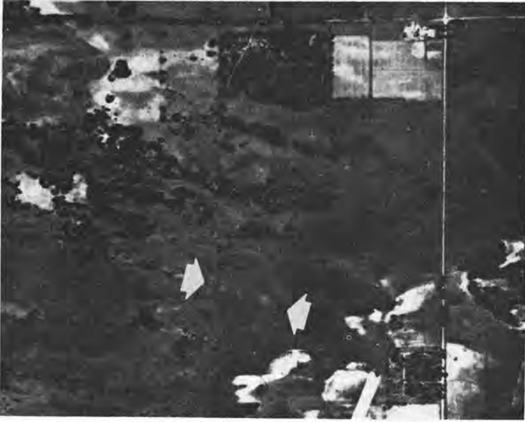
FRONTISPIECE. Area of sandy to clayey ground moraine and crevasse fillings, South-central Dupage County, Illinois. Solid arrows indicate fracture trace which is approximately aligned with light-colored, sandy crevasse deposits to the left. (See text page 502.)