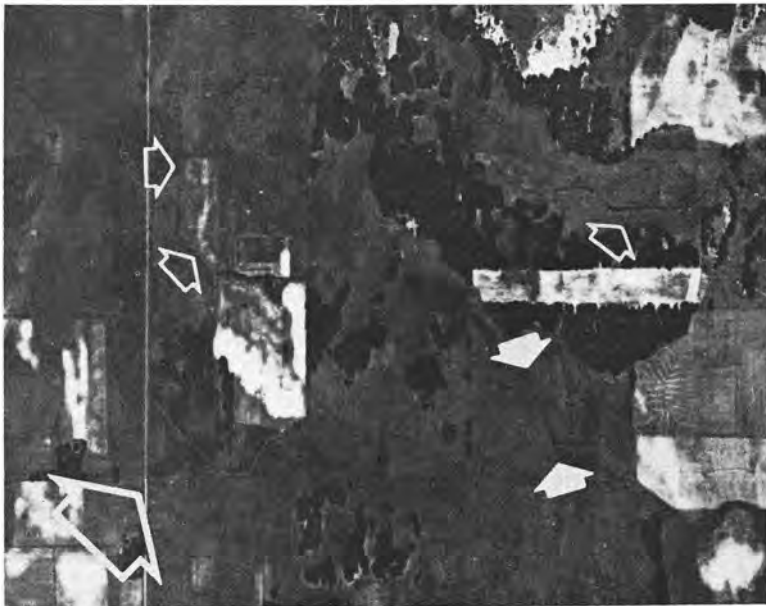
FIG. 4. Area of clayey ground moraine, northeastern Illinois, depth not exceeding 30 feet in this photograph. Solid arrows indicate fracture trace defined by soil tonal differences; other arrows indicate straight stream segments. Quarrying operations in bedrock dolomite are underway to the east. True North indicated by large arrow.

generally light tones; these deposits usually do not contrast with sandy ground moraine, but can be readily identified against a dark-toned background of clayey ground moraine.