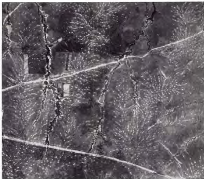
FIG. 1. Portion of an aerial photograph (at reduced scale) showing anthill sites on an Argentine study unit of 2,300 hectares. Anthills show as white dots, often arranged in radiating or "herringbone" patterns.