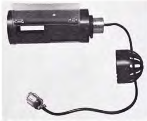
FIG. 3. Viewing-shutter assembly removed from the tracing table.

nesses, and head gear, with cylinder, disk, or belt shutters. The present design, however, has served adequately for all the installations thus far. It does not require the operator to wear anything extra and avoids the problem of interference with glasses that the operator may already wear. Moreover, the viewing field is kept centered on the tracing-table platen.