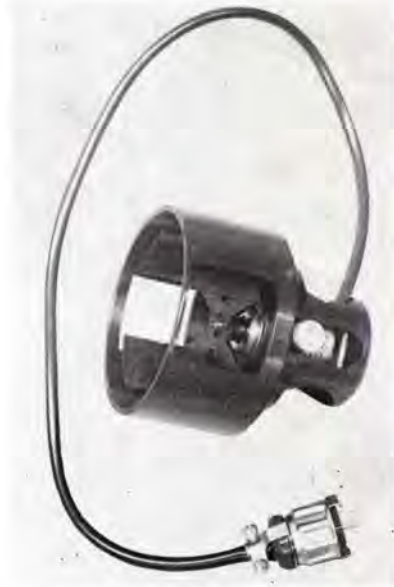
FIG. 2. Projection shutter for the M-2 plotter.

feasible placement for the projection shutter, without modifying the design of the projectors, is below the projection lens. However, the lenses of these plotters project the entire model at one time, over the full field of the photographs, whereas the area of interest is centered on the tracing table. A shutter capable of stopping and releasing the entire projected beam would be too large and heavy. The problem of adapting the StereoImage Alternator to the ER-55 plotter is therefore solved by incorporating swing suspensions which allow the two small projection shutters, with their longitudinal axes aligned in the y -direction, to move a limited distance in the x -direction. This sort of x -motion is easily controlled by metal roller tapes attached to the tracing table, and the shuttered portions of the projected beams are kept centered on the tracing table. The tapes are hinged and flexible when moved in the y -direction but adequately rigid when moved in the x -direction. Tension of the tapes on the projector, throughout the working range, is negligible. This swing-shutter arrangement can also be adapted to Multiplex projectors.