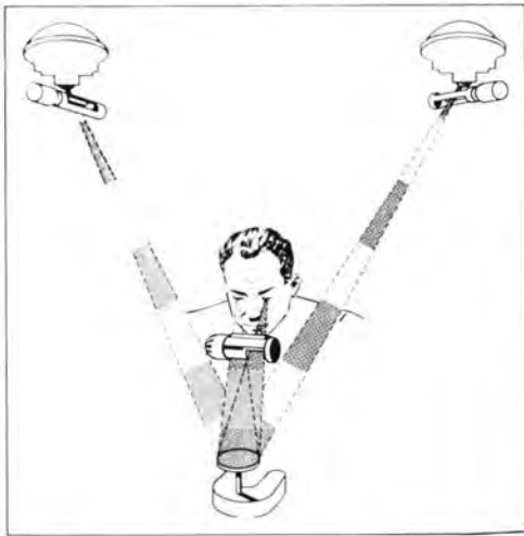
FIG. 1. Operating principles of the StereoImage Alternator system.