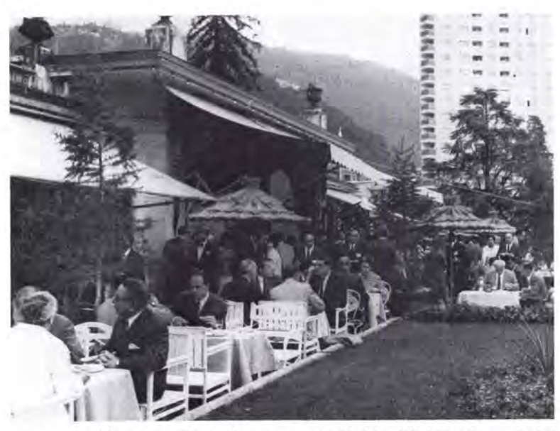
A garden party at the Montreaux Palace Hotel was provided by Wild Heerbrugg Ltd. Montreaux is located on the north shore of Lake Geneva (Lac Léman) about 15 miles eastward from Lausanne, and readily accessible by boat, train and bus. A modern building contrasts with castles on the mountain-side.

group in the preceding category, emphasis was on current fields of interest as well as possible future investigations. While there were displays by several universities and technical institutions, there was none from the United States. The ITC, which is now called the International Institute for Aerial Survey and Earth Sciences, displayed two training aids, the ITC Stereoscan and the ITC Stereotrainer. The other universities showed an outline of their courses and research activities. There was also an exhibit of books, both old and newly published, on photogrammetry and photointerpretation. U. S. National Aeronautics and Space Administration displayed a large composite photograph of the Apollo Landing Zone as well as some striking color photographs of the earth taken from manned satellites.