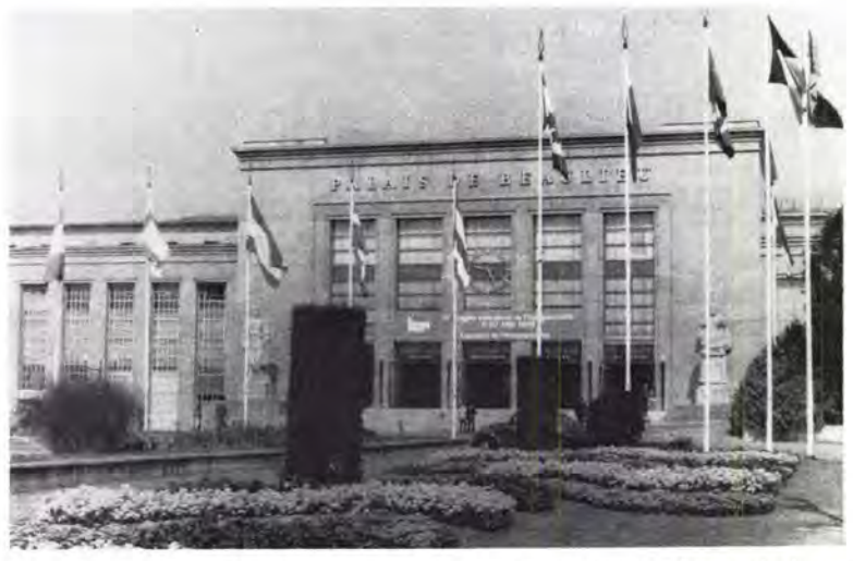
All the meetings, exhibits, luncheons, and the banquet were held in the Palais de Beaulieu in Lausanne, Switzerland.