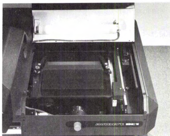
FIG. 2. Picture carriage and measuring system.

The display of measuring-mark position, which has been well received on the AC 1, can also be ordered as an option for the BC 1. An illuminated point, which is driven synchronously with the movement of the right measuring mark, indicates on a corresponding paper print of the right photo-