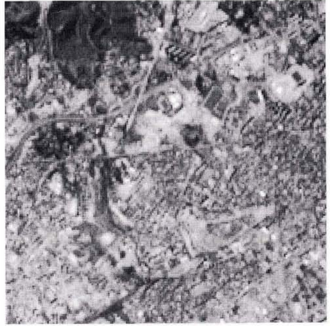
Figure 2. As Figure 1 but SPOT XS1.