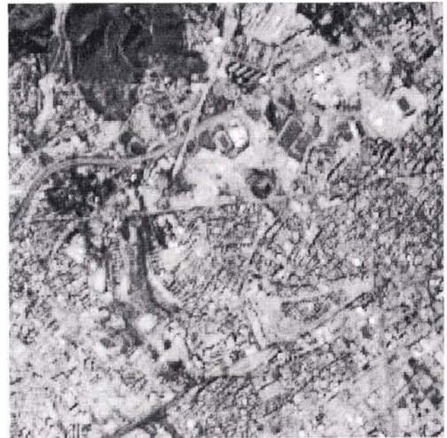
Figure 4. As Figure 3 but XS1-HR.

in the SPOT case) degraded to the lowest resolution (e.g., 20 m in the SPOT case). During the process, a resampling of the multispectral images is made. The resampling operator has an influence upon the final result. In most cases, a bi-cubic interpolator offers a good compromise between the accuracy of the result and the required computer time. In the following, for the sake of the simplicity, the term "image of lowest resolution" will denote the projected resampled image of lowest resolution, if this is required.