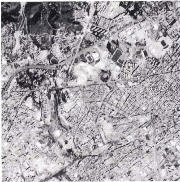
Figure 1. SPOT P image (see text for explanations).