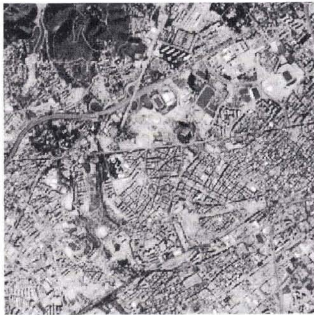
Figure 3. XP1 synthetic image (see text for explanations).